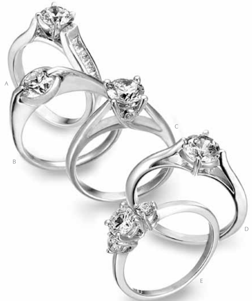
A. Platinum Princess Channel Semi-Mount Diamond Engagement Ring .24 TW. Style# 5839, $2,499