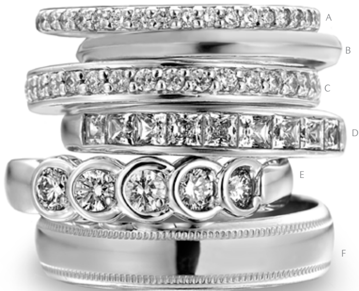
A. Platinum Micro Pave Diamond Band .12 TW. Style# R5671, $1,199