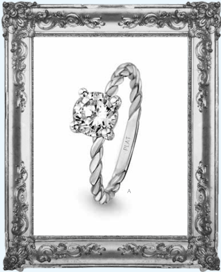
A. Platinum Twisty Shank Solitaire Engagement Ring .33 TW. Style# R2157/33, $2,099