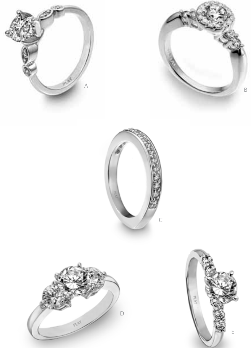
A. Platinum Bezel Semi-Mount Engagement Ring .08 TW. Style# 2272, $1,999 B. Platinum Semi-Mount Halo Diamond Engagement Ring .44 TW. Style# 2288/50L, $2,499 C. Platinum Diamond Band .26 TW. Style# MB5139D, $2,499 D. Platinum Semi-Mount Diamond Engagement Ring .30 TW. Style# 1927, $2,299 E. Platinum Semi-Mount Diamond Engagement Ring .18 TW. Style# 2170, $1,849