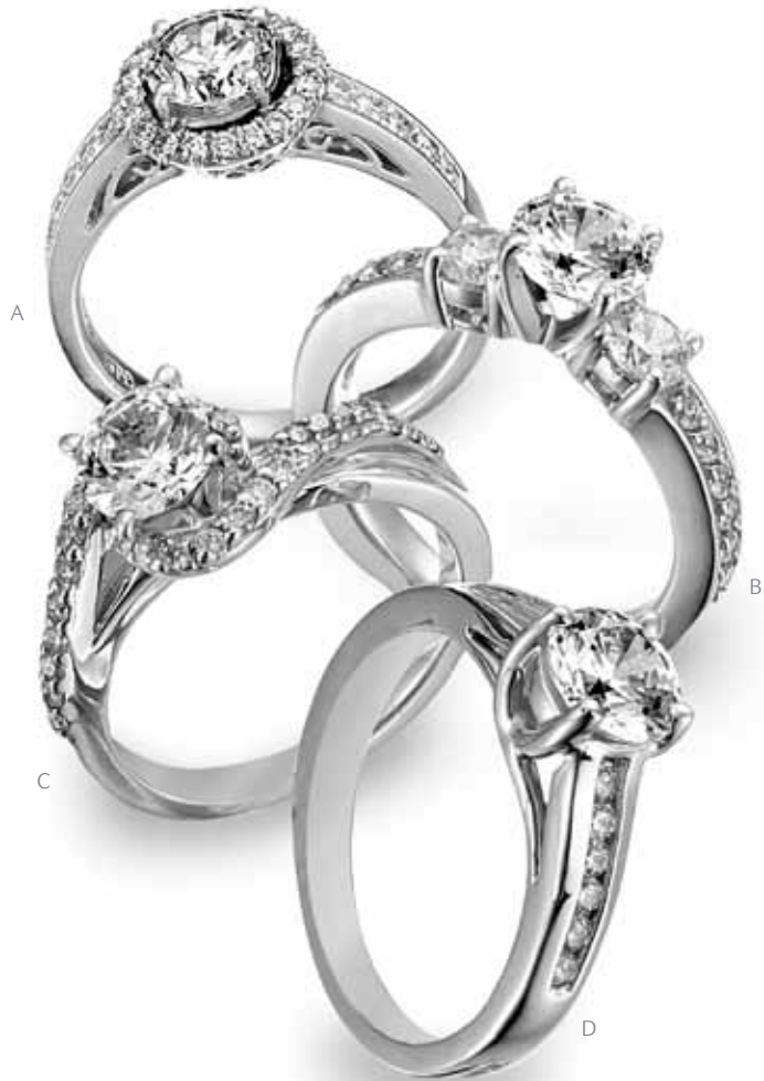
A. Platinum Semi-Mount Halo Diamond Engagement Ring .28 TW. Style# R5994, $2,499 B. Platinum Semi-Mount Diamond Engagement Ring .30 TW. Style# 5080L, $2,499 C. Platinum Semi-Mount Diamond Engagement Ring .14 TW. Style# 2140L, $2,499 D. Platinum Channel Semi-Mount Trellis Engagement Ring .14 TW. Style# R5105/50, $2,299