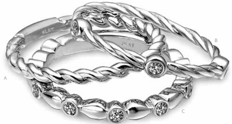
A. Platinum Twisty Shank Solitaire Band. Style# MB2157, $999 B. Platinum Bezel Twisty Diamond Band .05 TW. Style# R2260, $999 C. Platinum Cluster Bezel Diamond Band .16 TW. Style# MB2277D, $1,999