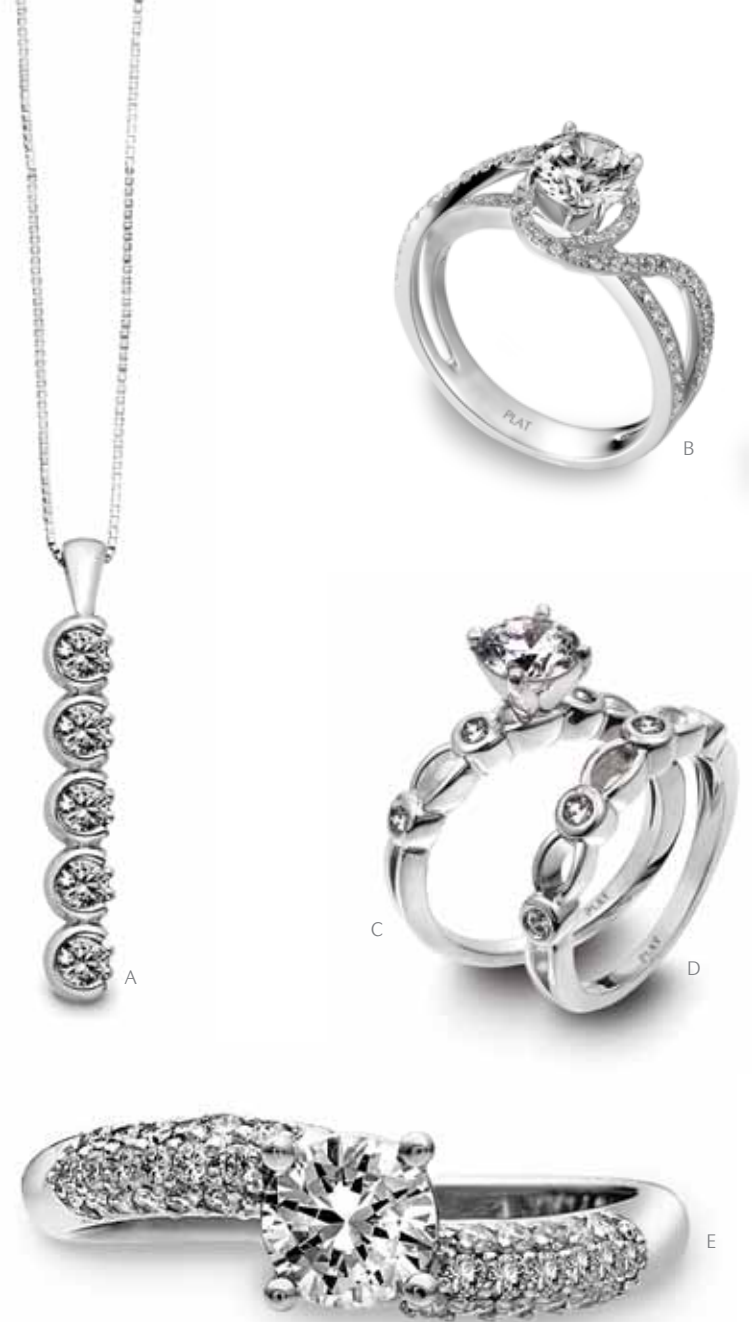
A. Platinum Bezel "5 Secrets" Diamond Pendant .25 TW. Style# 23500, $1,429 (Chain not included)